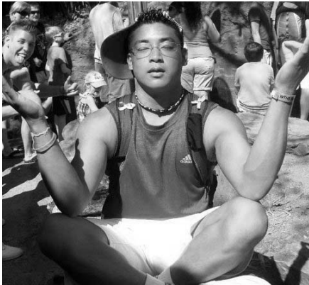
Ryan Francisco "Mr. January" Otto from Rocket Power