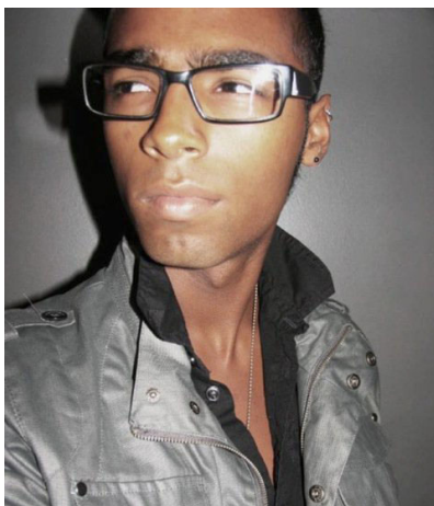
Alex McMichael "Mr. September" Arnold from Hey Arnold

What is the number one thing you look for in a significant other?