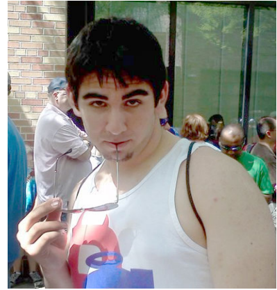
Ryan Lawrence “Mr. October” Harold from Hey Arnold

How about the guy who won Mr. Washington Township in 2011!!!